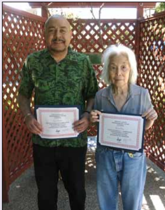
Stepping Stones Graduates